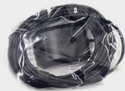
6. GPS ANTENNA