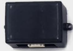
3. SPEAKER AMP