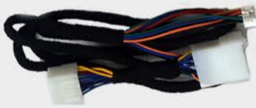
1. POWER CABLE