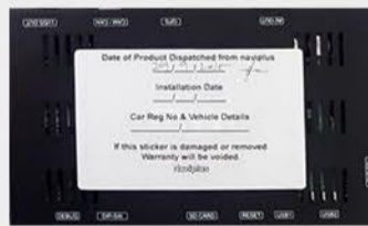
5. NAVIGATION BOX