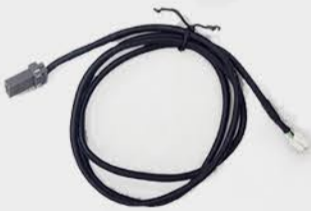
4. LVDS CABLE